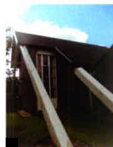
Roof refurbishments In FCAC completed in 2007

The Staff in the Irish Youth Justice Service would like to congratulate all the Staff and Boys who received awards, and may they keep on striving to better equip themselves for the future following on from their well deserved education and creativity Awards.